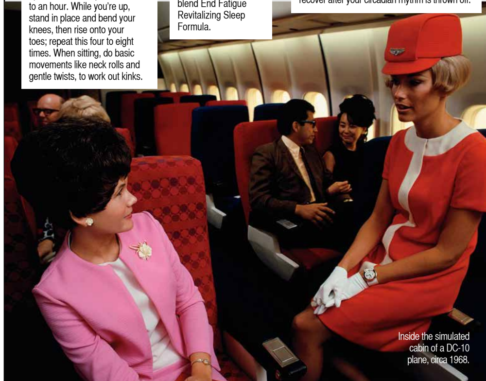
Inside the simulated cabin of a DC-10 plane, circa 1968.

Reset your body clock by eating and sleeping according to local time, which might mean skipping a meal or delaying it. The homeopathic remedies arnica and cocculus, taken in 30c doses just before takeoff, every three hours in the sky, then again after landing, can help you recover after your circadian rhythm is thrown off.